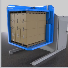
Add Replacement Pallet