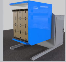
Safe & Easy To Use