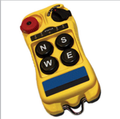
Push Button Remote