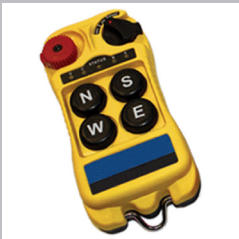
Push Button Remote