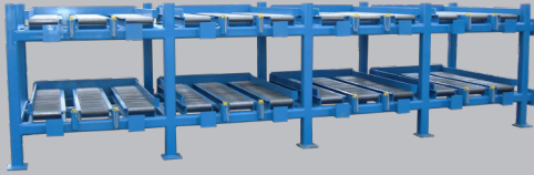
Mold & Die Storage Rack