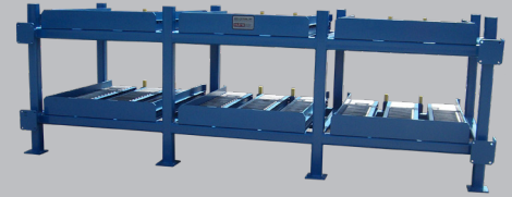
6-position Die Storage Rack