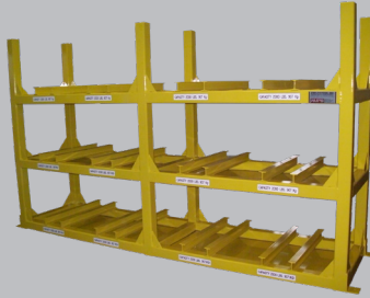
Heavy Die Storage Rack