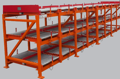
Die Storage Rack